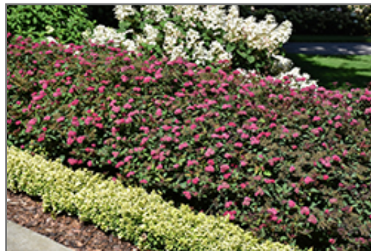
Double Play Doozie Spirea in bloom

This shrub will require occasional maintenance and upkeep, and is best pruned in late winter once the threat of extreme cold has passed. It is a good choice for attracting butterflies to your yard, but is not particularly attractive to deer who tend to leave it alone in favor of tastier treats. It has no significant negative characteristics.