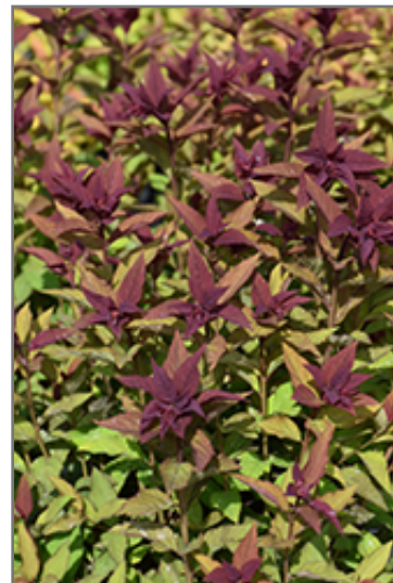
Double Play Doozie Spirea foliage

This shrub should only be grown in full sunlight. It prefers to grow in average to moist conditions, and shouldn't be allowed to dry out. It is not particular as to soil type or pH. It is highly tolerant of urban pollution and will even thrive in inner city environments. This particular variety is an interspecific hybrid.