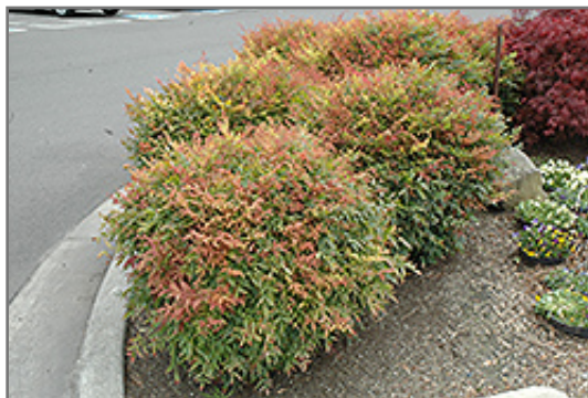
Sienna Sunrise Nandina