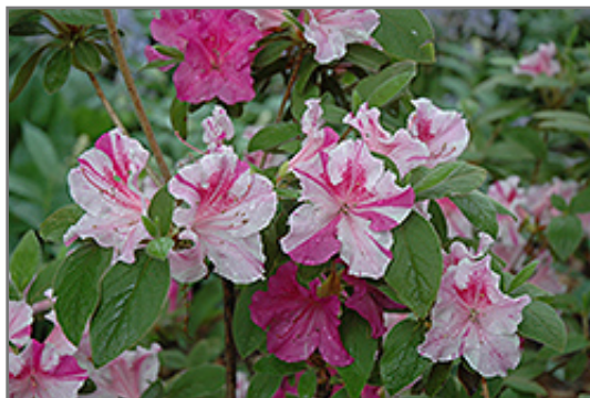
Encore Autumn Twist Azalea flowers