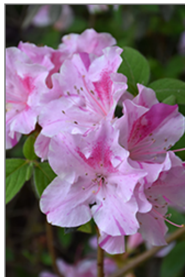
Encore Autumn Twist Azalea flowers