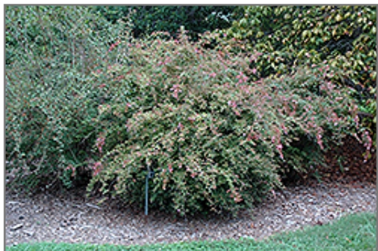
Edward Goucher Abelia in bloom