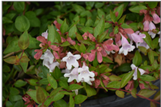
Edward Goucher Abelia flowers

Edward Goucher Abelia is recommended for the following landscape applications;