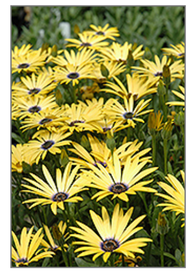
Lemon Symphony African Daisy flowers