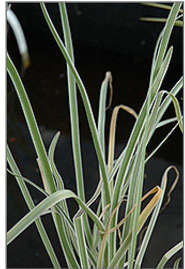
Variegated Society Garlic foliage

* This is a 'special order' plant - contact store for details