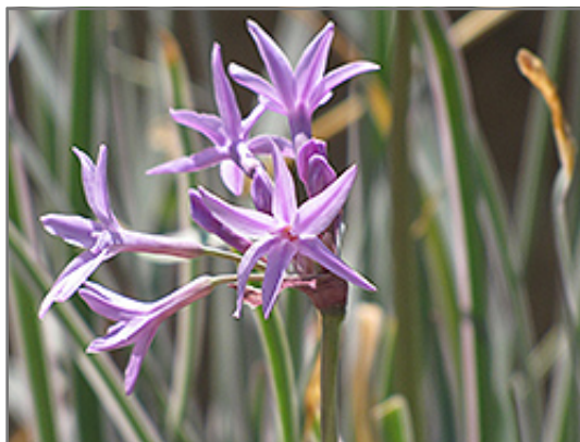
Variegated Society Garlic flowers

Variegated Society Garlic features showy spikes of violet star-shaped flowers with pink overtones rising above the foliage from mid spring to late summer. The flowers are excellent for cutting. Its attractive grassy leaves remain light green in color with prominent white stripes and tinges of silver throughout the season.