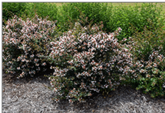
Ruby Anniversary Abelia in bloom