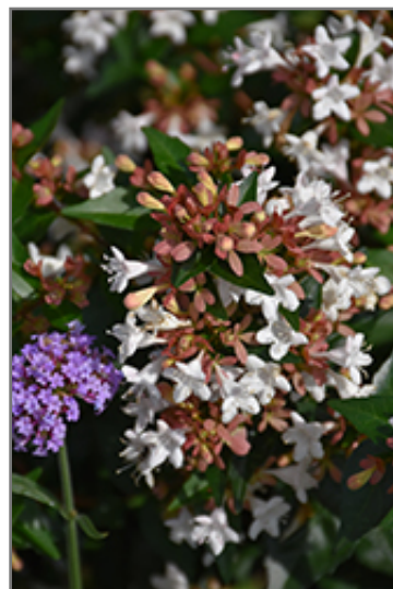
Ruby Anniversary Abelia flowers

This shrub will require occasional maintenance and upkeep, and should only be pruned after flowering to avoid removing any of the current season's flowers. It is a good choice for attracting birds, bees and butterflies to your yard, but is not particularly attractive to deer who tend to leave it alone in favor of tastier treats. It has no significant negative characteristics.