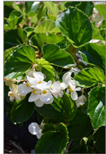
BabyWing White Begonia flowers