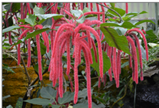
Firetail Chenille Plant flowers