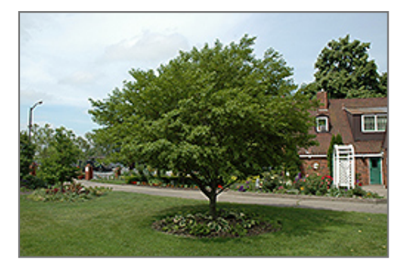
Fragrant Snowbell