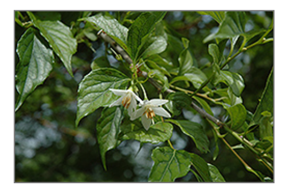
Fragrant Snowbell flowers