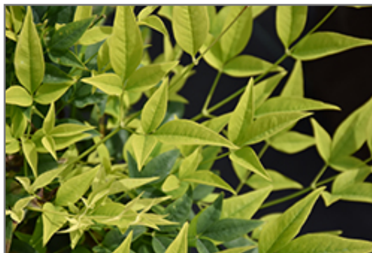
Lemon Lime Nandina foliage