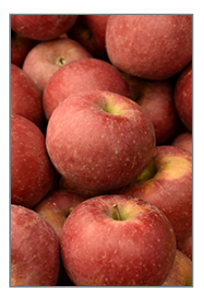
Winesap Apple fruit