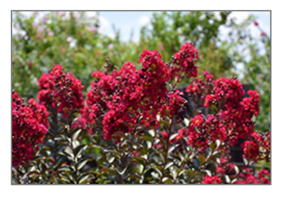
Double Feature Crapemyrtle flowers

1075 North James Campbell Boulevard Columbia, TN, 38401 ph: 931-388-3421