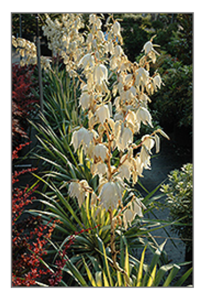
Color Guard Adam's Needle in bloom