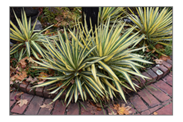
Color Guard Adam's Needle

Color Guard Adam's Needle is recommended for the following landscape applications;