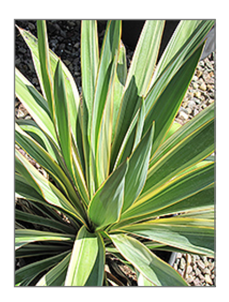
Color Guard Adam's Needle

This shrub should only be grown in full sunlight. It prefers dry to average moisture levels with very well-drained soil, and will often die in standing water. It is considered to be drought-tolerant, and thus makes an ideal choice for xeriscaping or the moisture-conserving landscape. It is not particular as to soil type or pH. It is somewhat tolerant of urban pollution. This is a selection of a native North American species.