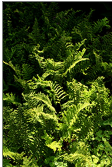
Lady Fern foliage