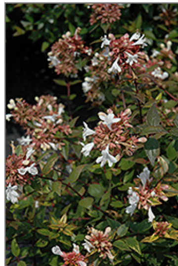
Little Richard Glossy Abelia flowers

Little Richard Glossy Abelia is recommended for the following landscape applications;