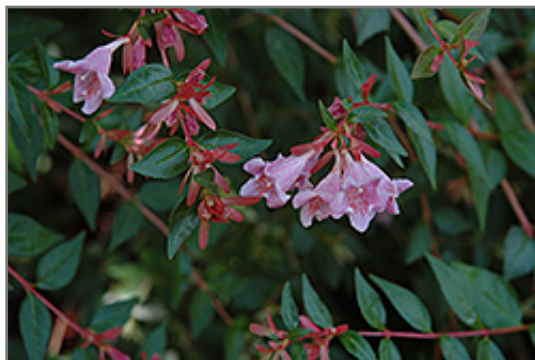
Little Richard Glossy Abelia flowers