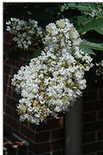
Natchez Crapemyrtle flowers

This is a relatively low maintenance tree, and is best pruned in late winter once the threat of extreme cold has passed. It is a good choice for attracting bees to your yard, but is not particularly attractive to deer who tend to leave it alone in favor of tastier treats. It has no significant negative characteristics.