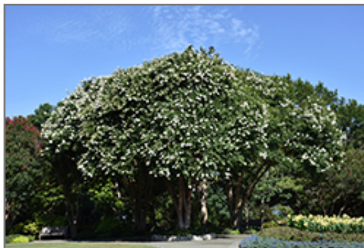
Natchez Crapemyrtle in bloom