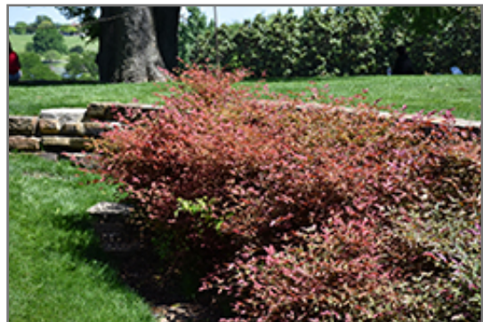
Flirt Nandina

Flirt Nandina is recommended for the following landscape applications;