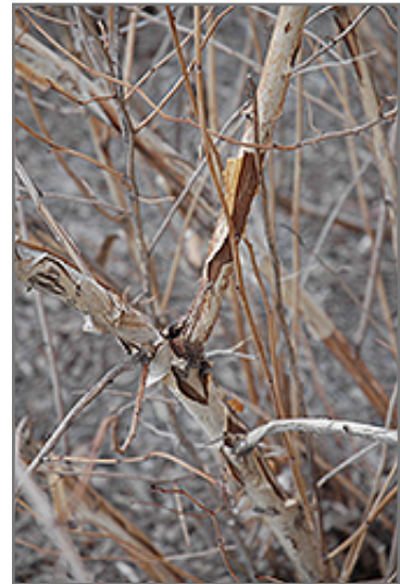
Diablo Ninebark bark

This shrub does best in full sun to partial shade. It is very adaptable to both dry and moist locations, and should do just fine under average home landscape conditions. It is not particular as to soil type or pH. It is highly tolerant of urban pollution and will even thrive in inner city environments. This is a selection of a native North American species.