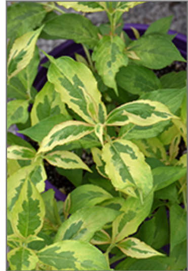
My Monet Sunset Weigela foliage

My Monet Sunset Weigela is recommended for the following landscape applications;