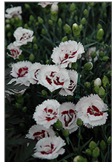
Scent First Coconut Surprise Pinks flowers