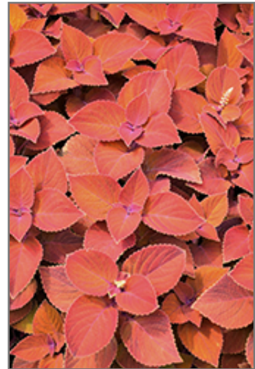
ColorBlaze Sedona Sunset Coleus foliage