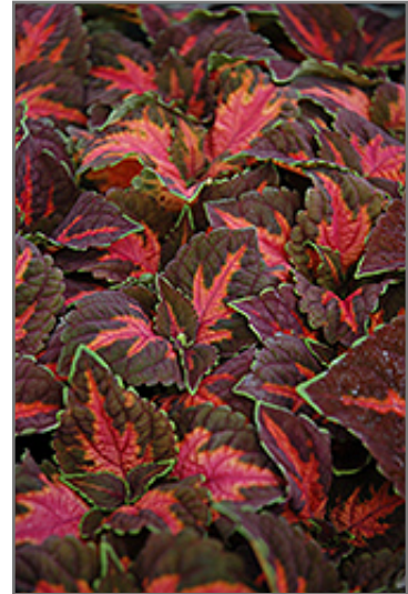
Superfine Rainbow Festive Dance Coleus foliage