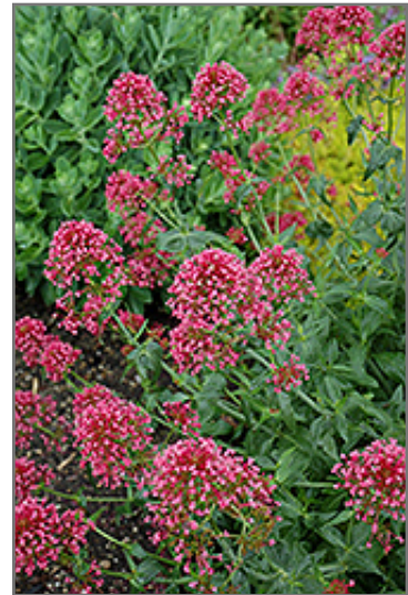
Red Valerian flowers

Red Valerian is recommended for the following landscape applications;