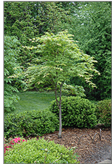
Osakazuki Japanese Maple