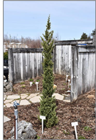
Trautman Juniper

This shrub should only be grown in full sunlight. It is very adaptable to both dry and moist growing conditions, but will not tolerate any standing water. It is not particular as to soil type or pH. It is highly tolerant of urban pollution and will even thrive in inner city environments. This is a selected variety of a species not originally from North America.