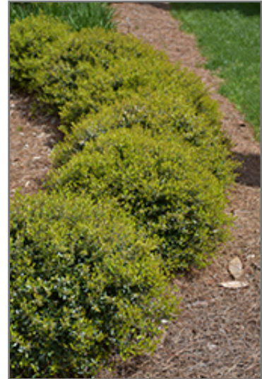
Schilling's Dwarf Yaupon Holly