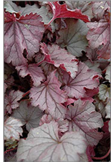
Little Cuties Sugar Berry Coral Bells foliage

Little Cuties Sugar Berry Coral Bells is recommended for the following landscape applications;