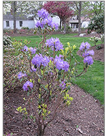
Blue Baron Rhododendron in bloom

This shrub does best in full sun to partial shade. You may want to keep it away from hot, dry locations that receive direct afternoon sun or which get reflected sunlight, such as against the south side of a white wall. It requires an evenly moist well-drained soil for optimal growth, but will die in standing water. It is very fussy about its soil conditions and must have rich, acidic soils to ensure success, and is subject to chlorosis (yellowing) of the foliage in alkaline soils. It is somewhat tolerant of urban pollution, and will benefit from being planted in a relatively sheltered location. Consider applying a thick mulch around the root zone in winter to protect it in exposed locations or colder microclimates. This particular variety is an interspecific hybrid.