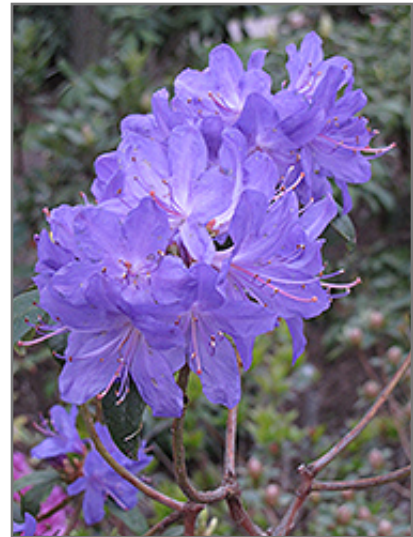
Blue Baron Rhododendron flowers