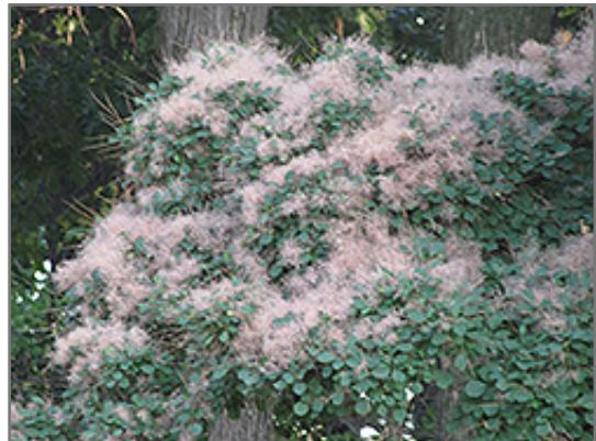
American Smoketree in bloom