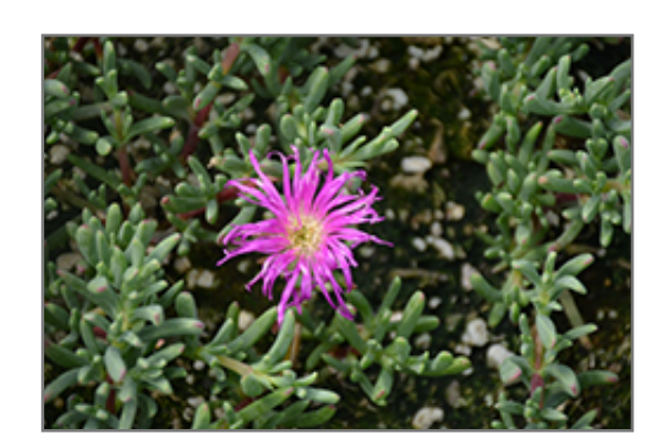
Purple Iceplant flowers