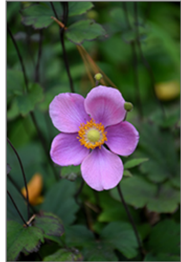
Lucky Charm Anemone flowers