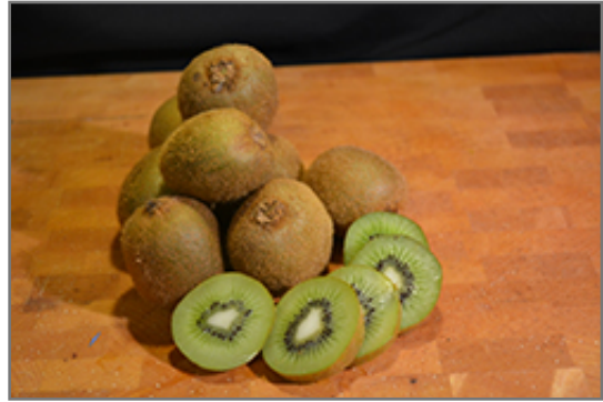
Kiwifruit fruit and flesh