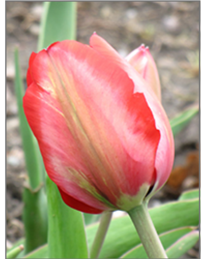
Menton Tulip flowers