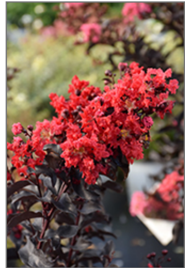
Center Stage Red Crapemyrtle flowers

Center Stage Red Crapemyrtle is recommended for the following landscape applications;