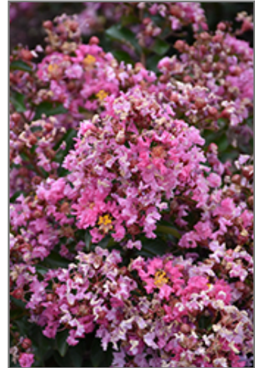
Barista Peppermint Mocha Crapemyrtle flowers

Barista Peppermint Mocha Crapemyrtle is recommended for the following landscape applications;