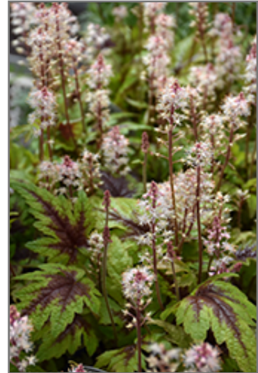
Sugar And Spice Foamflower flowers

Sugar And Spice Foamflower is recommended for the following landscape applications;