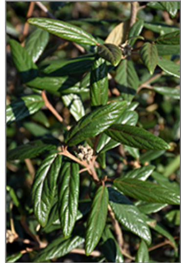
Prague Viburnum foliage

This shrub does best in full sun to partial shade. It prefers to grow in average to moist conditions, and shouldn't be allowed to dry out. It is not particular as to soil type or pH. It is highly tolerant of urban pollution and will even thrive in inner city environments. This particular variety is an interspecific hybrid.