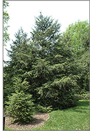
Canadian Hemlock