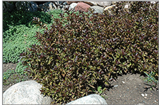
Dark Horse Weigela