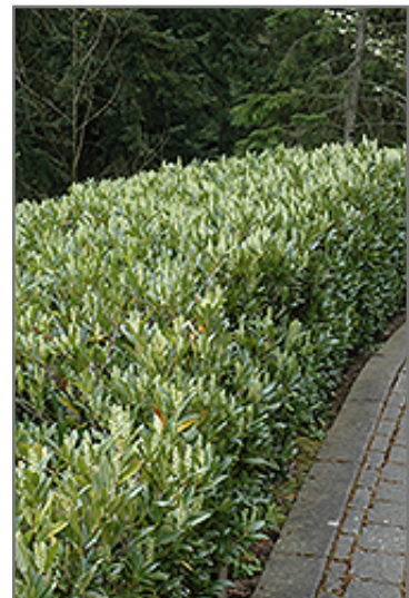
Otto Luyken Dwarf Cherry Laurel in bloom