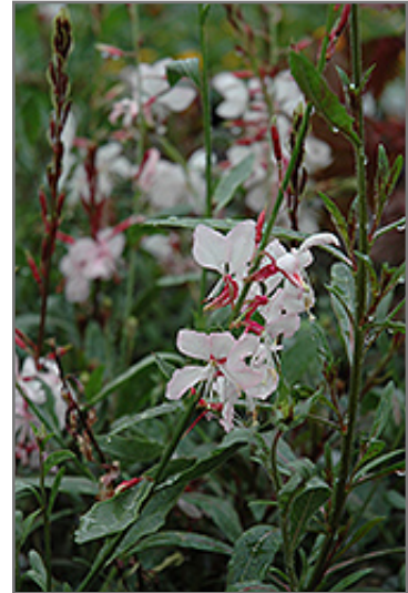
Ballerina Blush Gaura flowers

Ballerina Blush Gaura is recommended for the following landscape applications;