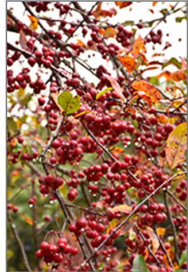
Prairifire Flowering Crab fruit

This tree should only be grown in full sunlight. It prefers to grow in average to moist conditions, and shouldn't be allowed to dry out. It is not particular as to soil type or pH. It is highly tolerant of urban pollution and will even thrive in inner city environments. This particular variety is an interspecific hybrid.