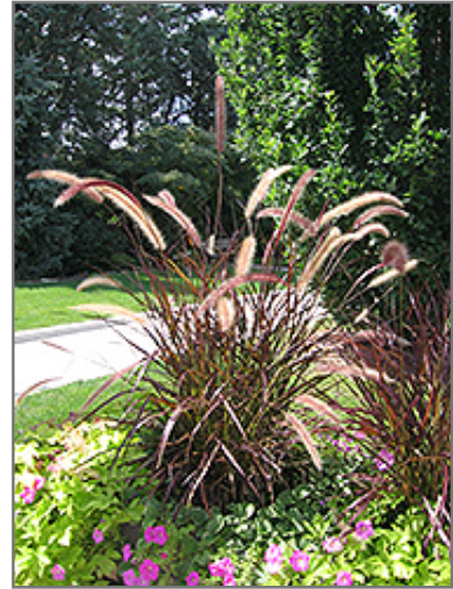
Purple Fountain Grass flowers

Purple Fountain Grass is recommended for the following landscape applications;