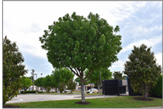
Chinese Pistache